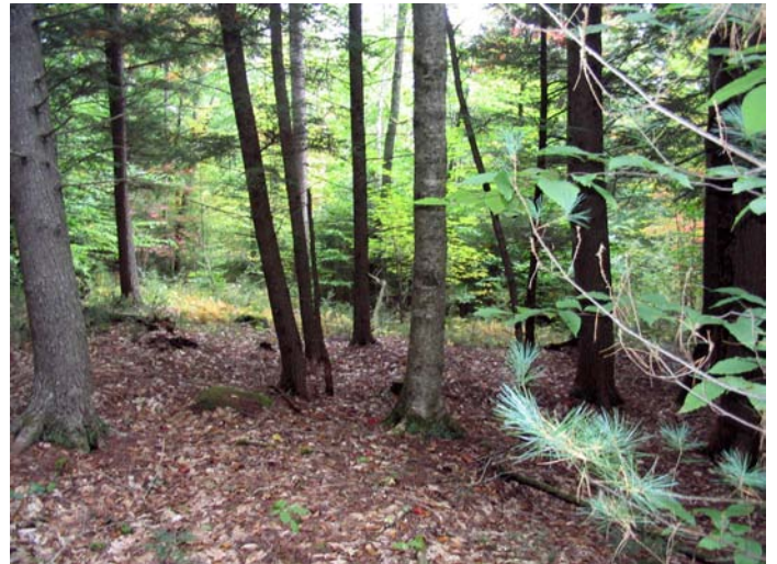
The donated wooded parcel has been cared for by a local forester.